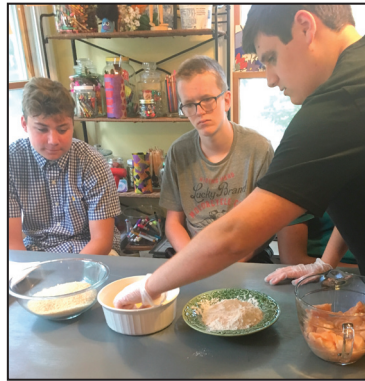
Summer Camp clients learn important life skills such as cooking.